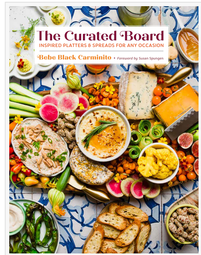
"The Curated Board" by Bebe Black Carminito

Inspired by her background in food styling, makeup artistry, performing arts, and a passion for gastronomy, Carminito transforms ordinary ingredients into extraordinary culinary creations. The Curated Board is more than just a cookbook; it