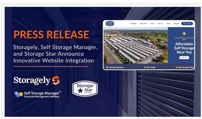
Press Release with Self Storage Manager

WINSTON-SALEM, NC, UNITED STATES, September 2, 2024 /EINPresswire.com/ -- Storagely is excited to announce its first website integration with Self Storage Manager (SSM), now live at storagestar.com, one of the premier self-storage providers in the United States. This collaboration marks Storagely's third facility management