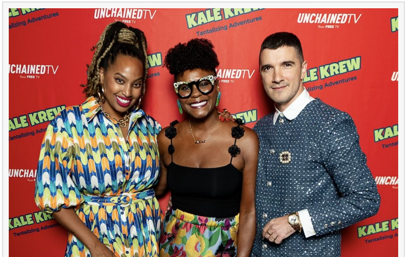
The stars of UnchainedTV's Kale Krew with Tabitha Brown at the premiere party.

This press release can be viewed online at: https://www.einpresswire.com/article/740272038