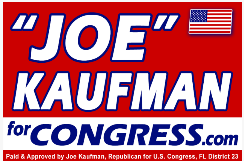
Joe Kaufman for Congress Logo