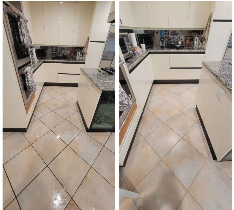
Tile Cleaning in Santa Monica

Tile and grout cleaning is more than just a routine maintenance task. Over time, the grout between tiles can accumulate dirt, grime, and stains, making even the most beautiful tiles appear lackluster. Regular mopping may not be sufficient to address these deep-seated issues, and that's where specialized cleaning services come into play.