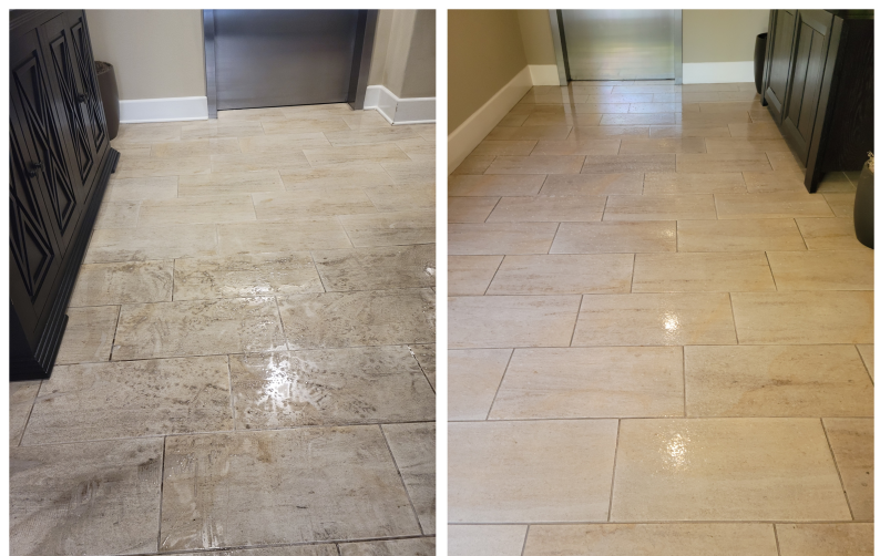
2 Panels: Before and After Tile and Grout Cleaning, How often should tile be professionally cleaned?

Sealing also makes future cleaning efforts more effective, as