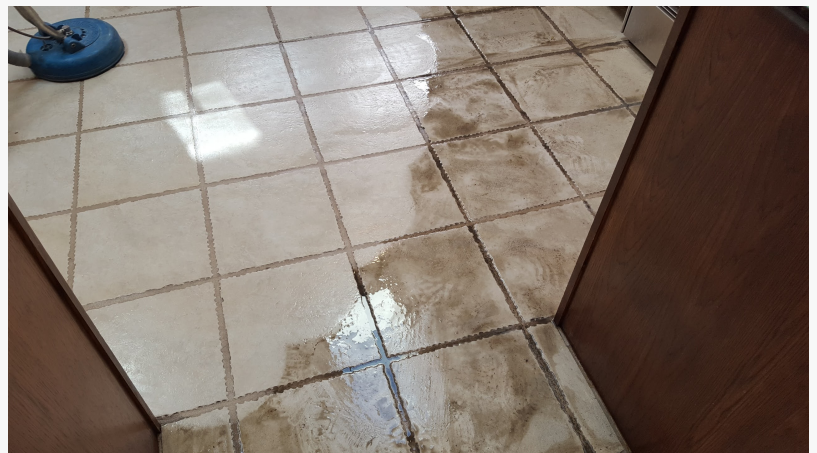
Side by side tile and grout cleaning, clean versus dirty