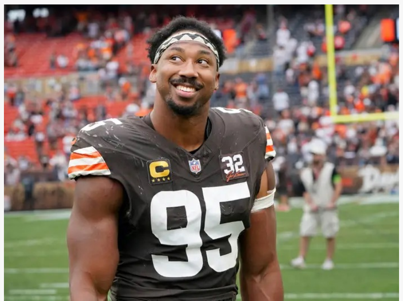
Cleveland Browns All-Pro Myles Garrett