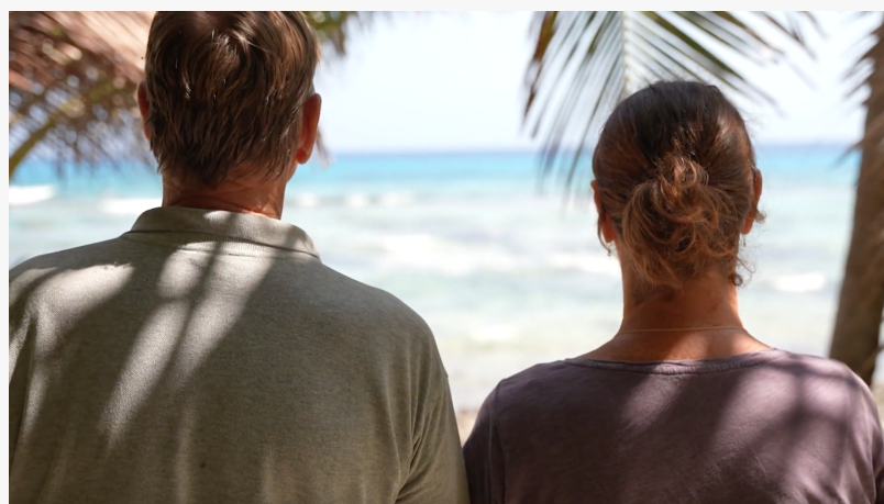
couple documentary from back