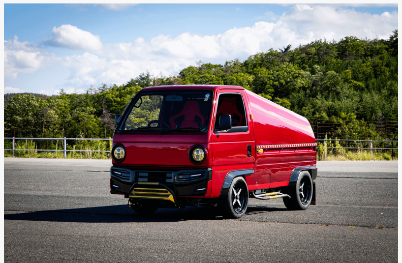
Oiwa Garage Provided Parts and Accessories For Customization Of This 1989 Honda Acty Truck

/EINPresswire.com/ -- Oiwa Garage, a leading name in the Japanese automotive aftermarket industry, is excited to announce the launch of its new Honda Acty Truck Parts Section. This latest addition to Oiwa Garage's extensive catalog is designed to cater to the growing demand for high-quality parts and accessories for Honda Acty mini trucks, one of Japan's most popular Kei trucks.