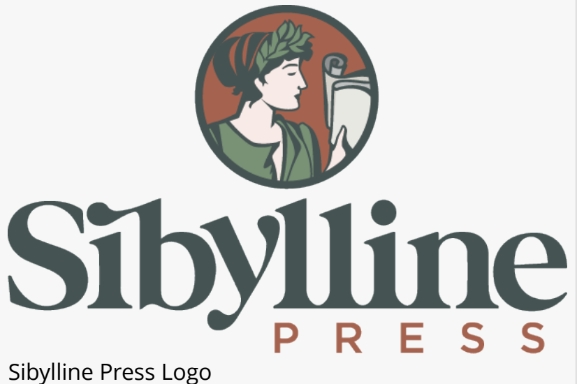
Sibylline Press Logo