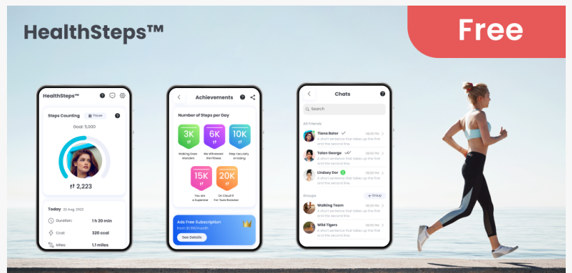
HealthStep(tm) Google App Overview