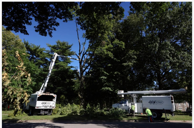
WTC Response in Burlington, IA

Williams Tree Company played a vital role in the Bloomington recovery efforts, mobilizing its crews immediately after the storm to begin the arduous task of clearing debris and restoring safety to the city. Over several days, the company's teams removed hundreds of piles of brush