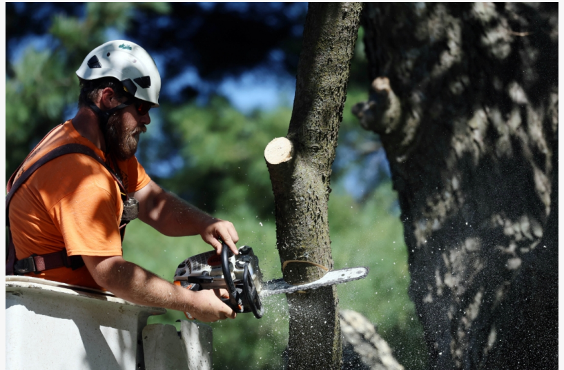
WTC Response in Burlington, IA

MARTINSVILLE, IN, UNITED STATES, September 4, 2024 /EINPresswire.com/ -- In response to the severe storms that struck Burlington, Iowa, over Labor Day weekend, Williams Tree Company quickly mobilized its expert crews to assist with critical storm response efforts. With significant damage across the region, including downed trees, blocked roadways, and widespread power outages, the company's rapid deployment was instrumental in helping the community recover swiftly and safely.