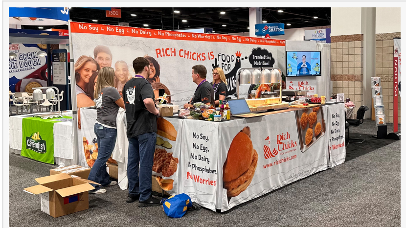
Trade Show Booth Design Los Angeles

“Our design team is committed to working hand-in-hand with our clients to produce banners that are not only aesthetically pleasing but also strategically designed to meet specific marketing objectives,” adds the Printing Fly team. “We believe that a well-crafted banner can be a game-changer at any trade show.”