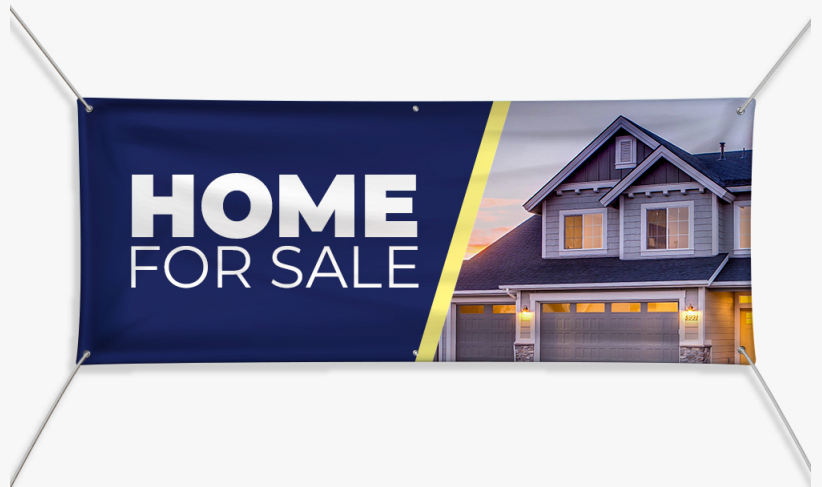
Real Estate Banners