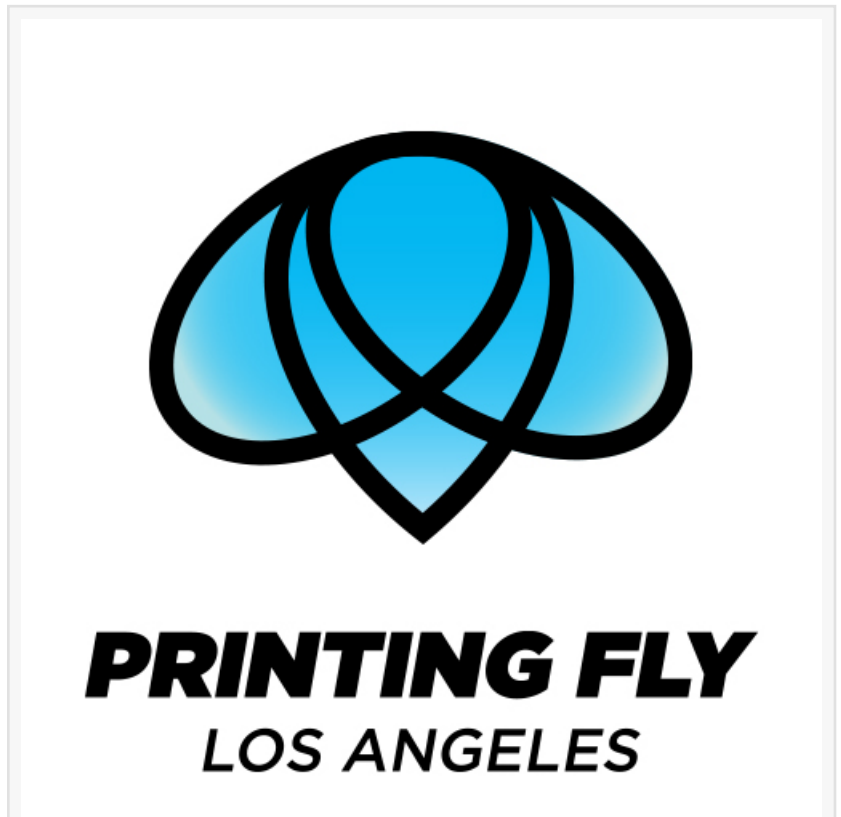
Printing Fly Los Angeles

Trade shows often feature a competitive environment where exhibitors must differentiate