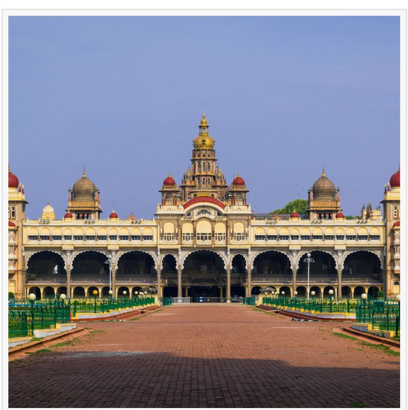
Majestic Mysore Palace: A Timeless Icon of Grandeur and Royal Heritage

The roadshow provides a strategic platform for Karnataka Tourism to highlight the state's unparalleled potential as a foremost travel destination. Karnataka's inimitable