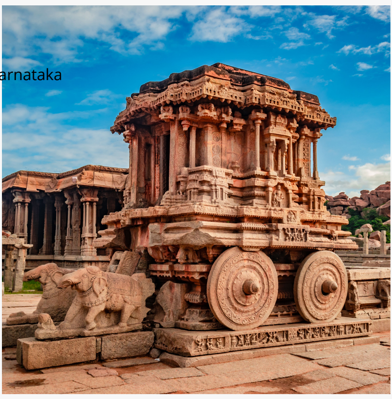
Stone Chariot of Hampi: An Icon of Timeless Craftsmanship and Architectural Brilliance