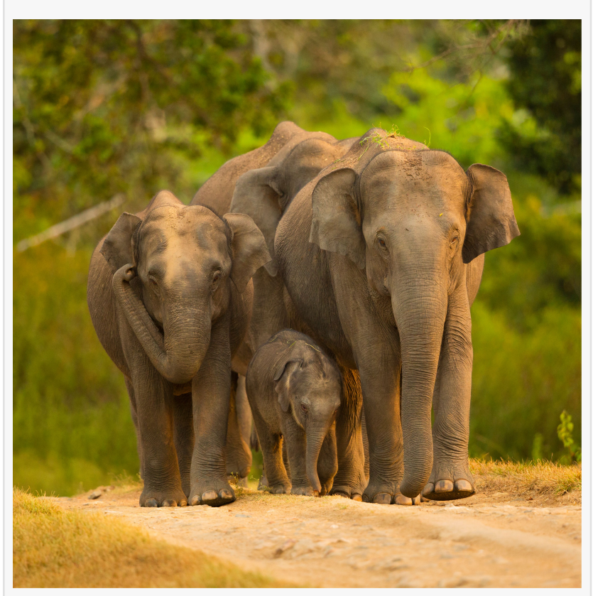
Elephant Family at Bandipur National Park in Karnataka