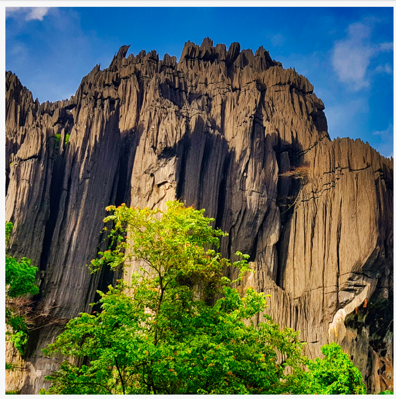
Yana Caves in the Heart of Karnataka