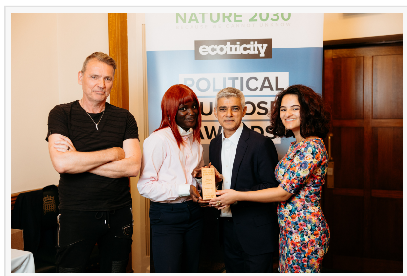
Award winner Sadiq Khan, pictured with Destiny Boka Batesa, Anjali Raman-Middleton and Dale Vince OBE

LONDON, UNITED KINGDOM, September 4, 2024 /EINPresswire.com/ -- London Mayor Sadiq Khan has been awarded the Pollution, Waste and Air at the 2024 Political Purpose Awards for his pivotal role in expanding the Ultra Low Emission Zone (ULEZ) across all London boroughs.