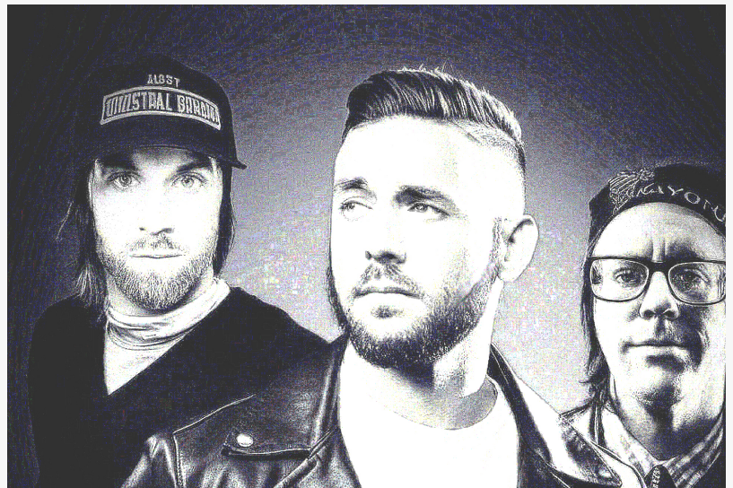
Generations - Take The Money

Generations Release New Single " Take The Money "