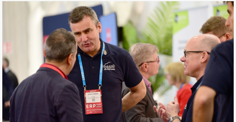
Meet with the leading ERP solution providers