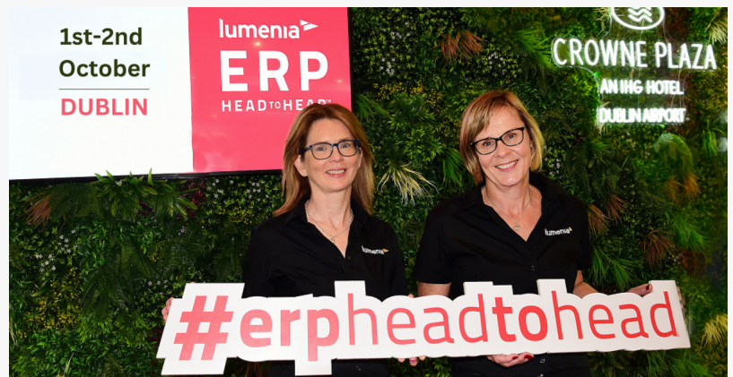
Meet the Lumenia team, independent ERP experts