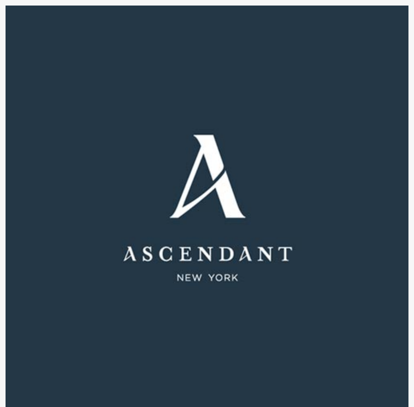
Ascendant Detox - NYC

Upon discharge, alumni are checked in with regularly, ensuring they feel supported as they transition back to daily life. Ascendant offers both in-person and virtual alumni support groups on a weekly basis, providing flexible options for staying connected regardless of location.