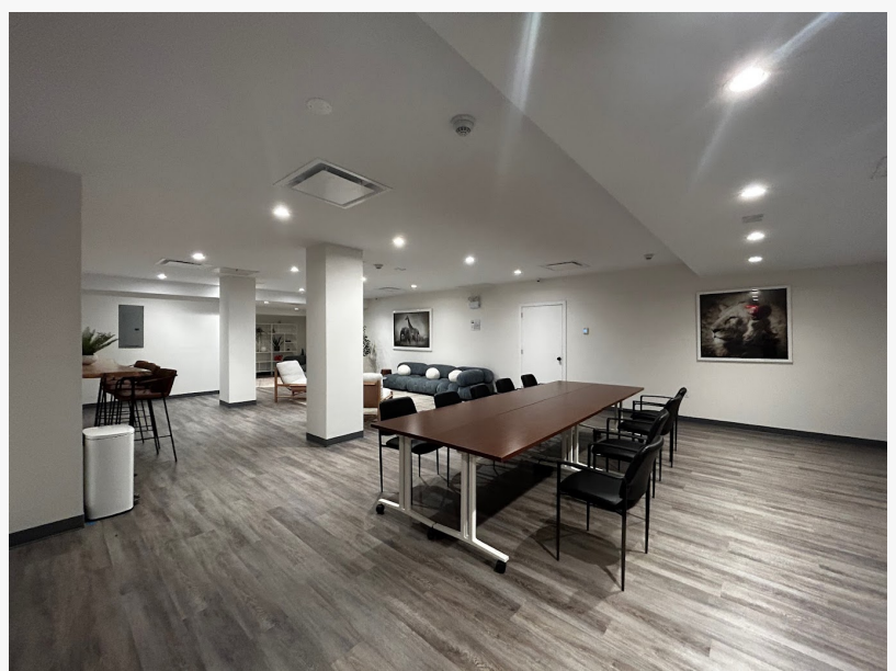
Ascendant IOP Painkiller Addiction Treatment

For more information about the Alumni Program or to learn more about Ascendant Intensive Outpatient Program NYC, please visit www.ascendantny.com or contact us at (917) 924-4456.