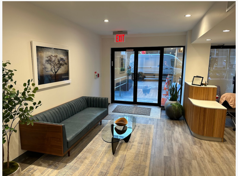
Ascendant Intensive Outpatient Program NYC Entrance