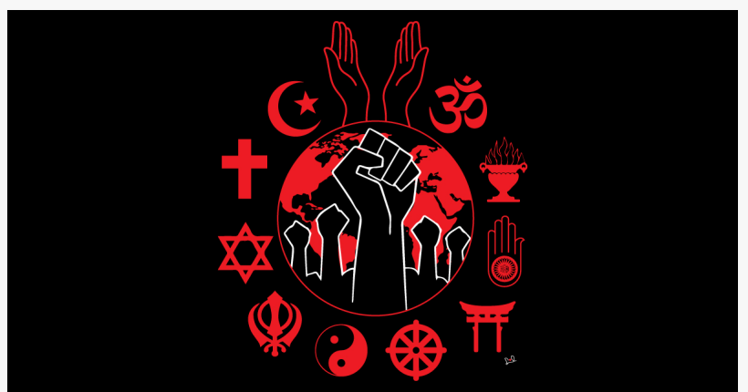
Multiple Award Winning Black Lives Matter Design including Mozaik Philanthropy Award