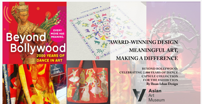
Capsule Collection created for The Asian Art Museum's Special Exhibition : Beyond Bollywood celebrating 2,000 years of dance