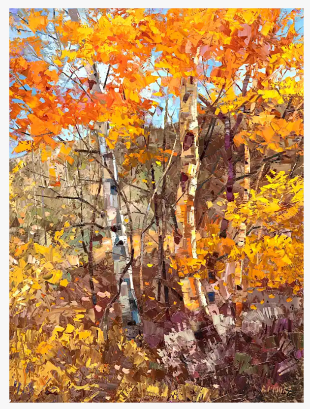
Robert Moore Beaux Arts Signature Artist 2024 Autumn Grove 48"x 36", oil on canvas