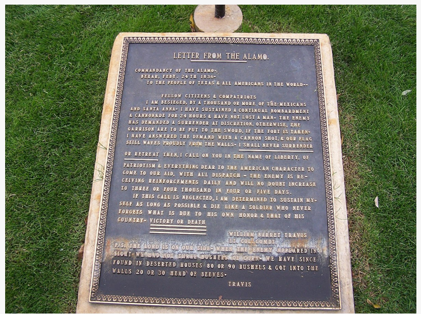
The most famous letter in Texas History.