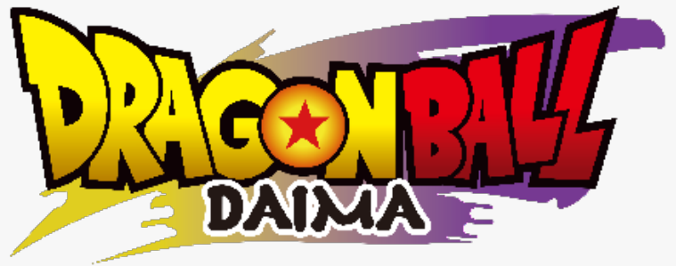
Dragon Ball DAIMA Logo

The new visual reveals the face of the new character Panzy, who was wearing a mask and cloak in the first main visual, as well as Gomah and a new mysterious character peering over the edge at Gomah. The new visual reveals the face of the new character Panzy, who was wearing a