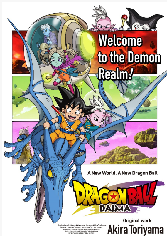
Dragon Ball DAIMA main