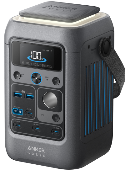
Anker SOLIX C300 DC

The C300 Series also includes integrated lighting solutions, with the C300 DC featuring a unique pop-up light and the C300 equipped with a front-facing light. Both models leverage LiFePO4 battery technology, providing a steady 288 watt-hours of capacity while delivering 300W of power.