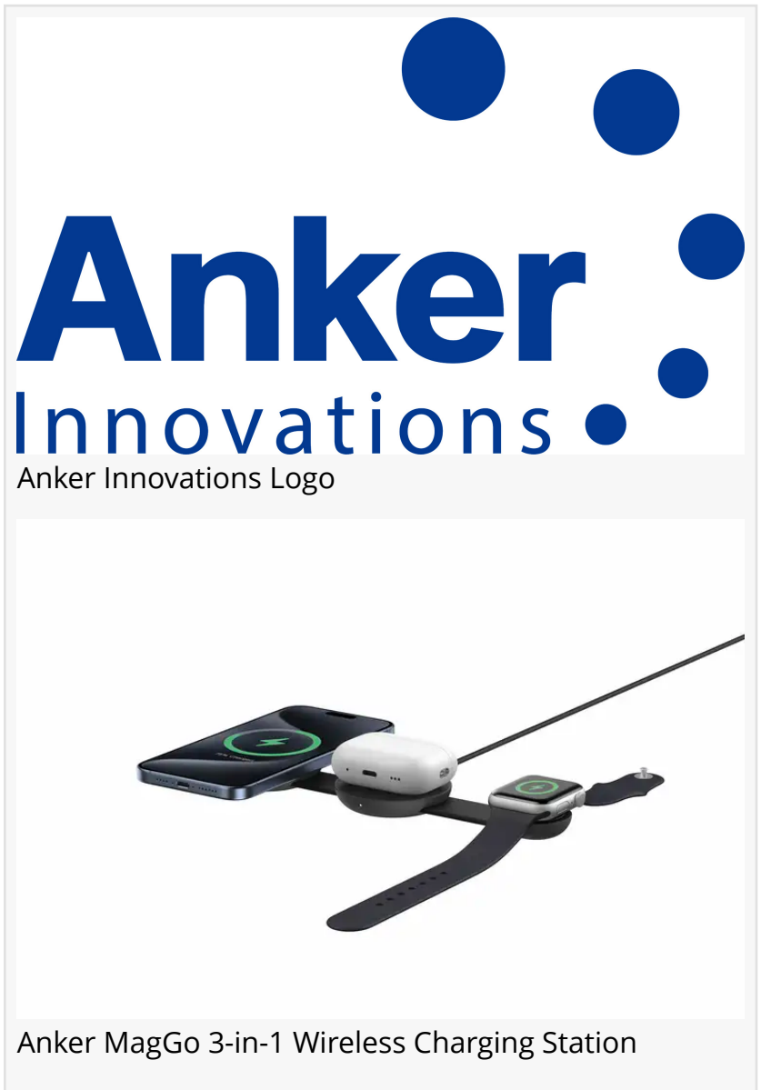
Anker MagGo 3-in-1 Wireless Charging Station

A unique foldable and portable charging station that can simultaneously charge an Apple Watch, iPhone, and AirPods.