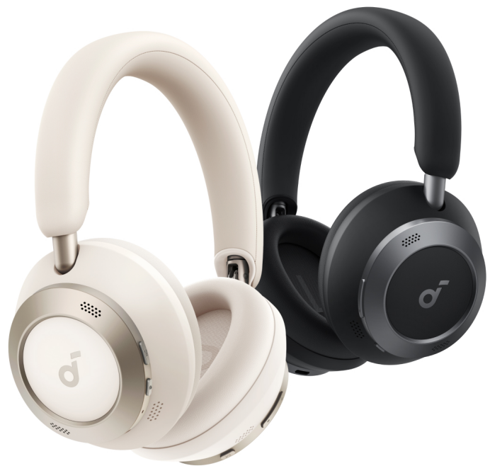
Soundcore Space One Pro in Black & White