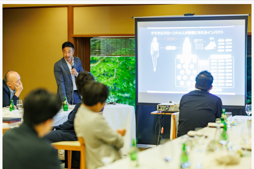
End of Work - alt Roundtable on the day of the event_2