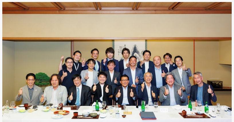
alt.ai launches “End of Work” roundtable with leaders in various fields to contribute to increasing Japan's GDP□Discussing global cutting-edge use cases for AI clones

As science fiction writer A.C. Clarke said, "It is only half true that humans invented technology; there is also the aspect that technology invented humans." alt believes that the development of AI technology will also promote the next evolution and expansion of humans.