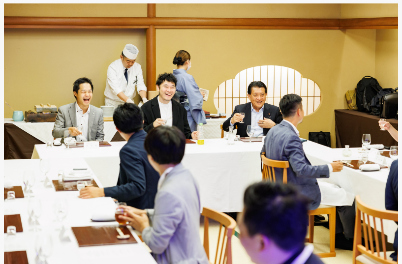
End of Work - alt Roundtable on the day of the event_3