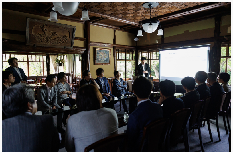
End of Work - alt Roundtable on the day of the event_1

alt believes that the development of AI technology will also promote the next evolution and expansion of humans.