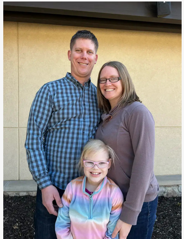
KC Blinds Motstratter Family