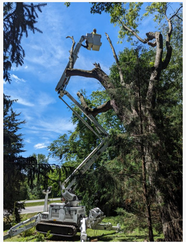
Crews clean up in the aftermath of the storm

Beyond assisting electrical providers, Williams Tree Company’s crews also worked with local public works and transportation departments to clear blocked roads and ensure that essential services could continue operating without disruption. By removing downed trees from roadways and public spaces, the company helped restore normal traffic flow and reduced the risk of further damage or injury.