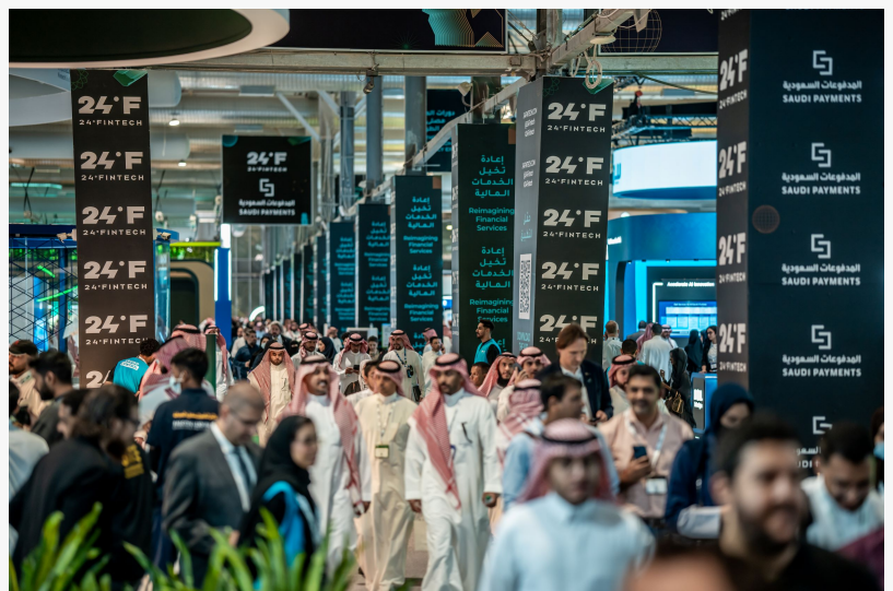
24 Fintech Crowned Largest Debut Fintech Event In History, Say Organisers