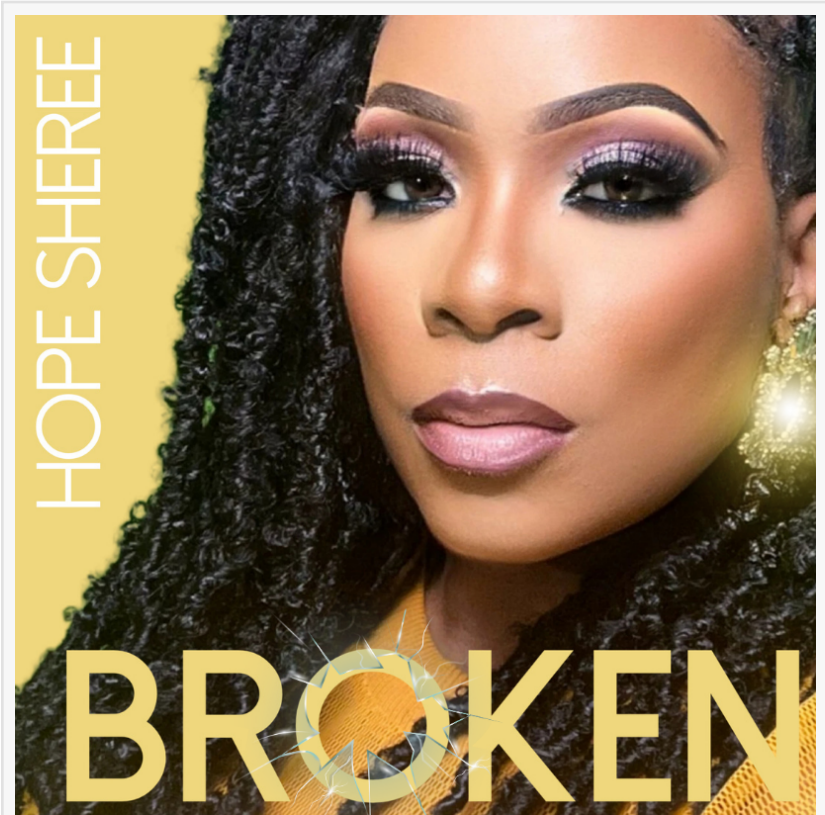
Broken Official CD Cover