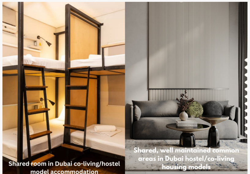
Grand Regal Real Estate Photo