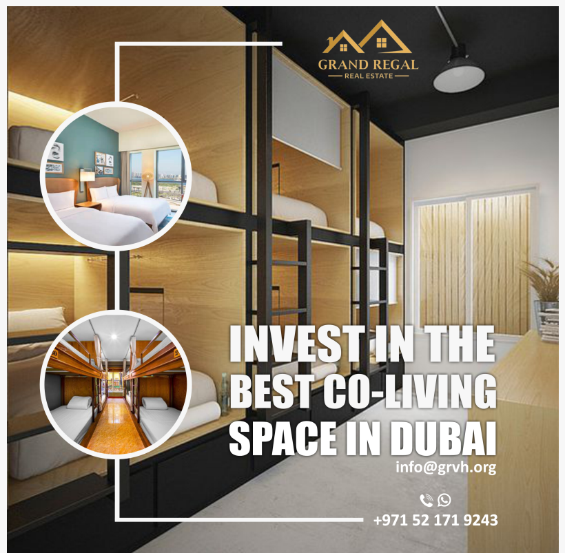
Grand Regal Real Estate Launches $10 Million Affordable and Flexible Co-Living and Shared Working Spaces in Dubai

Co-Living and Shared Working: A Modern Approach The co-living spaces will feature fully furnished apartments with shared common areas such as kitchens, living rooms, and recreational spaces, fostering a sense of community and enabling cost-sharing among tenants. The shared working spaces will provide businesses with access to professional amenities including high-speed internet, meeting rooms, and printing services, all within a collaborative environment.