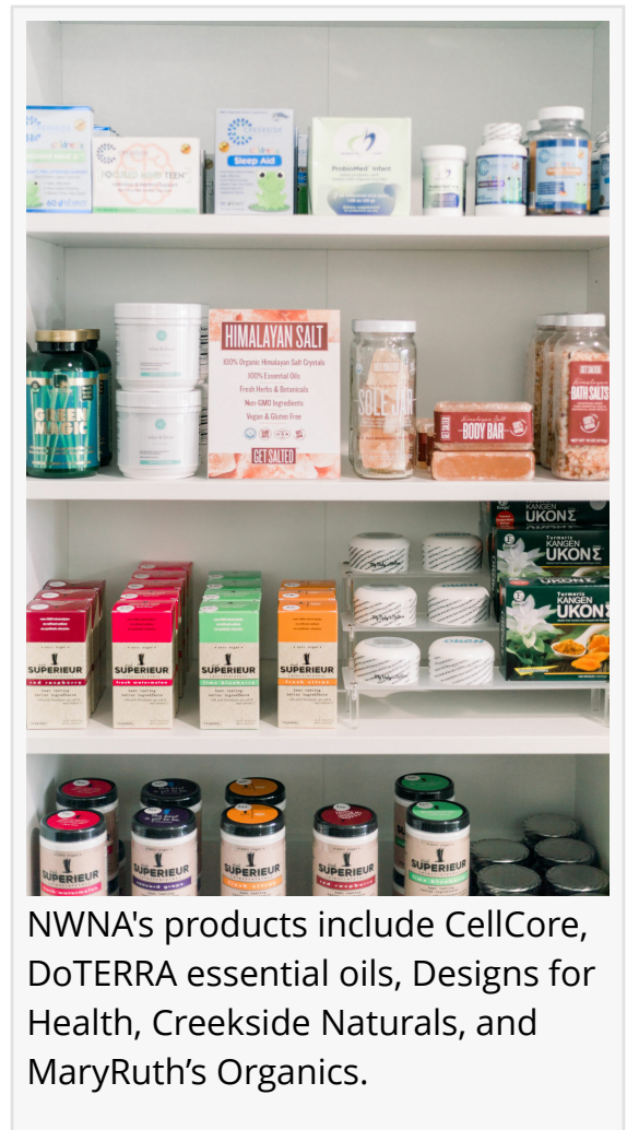
NWNA's products include CellCore, DoTERRA essential oils, Designs for Health, Creekside Naturals, and MaryRuth's Organics.

St. Bernard Economic Development Foundation (SBEDF) is the official economic development organization and public-private partnership of St. Bernard Parish formed to create and retain jobs, build prosperity, and improve quality of life. To learn more about SBEDF and how the organization works to foster business attraction, retention and expansion, neighborhood revitalization, small business assistance, and talent and workforce development in St. Bernard