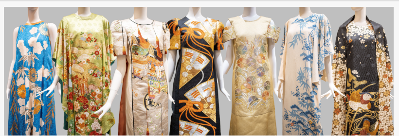
Seven VIP Attendant Haute Couture Dress designs have been unveiled

Fujimoto's designs breathe "life" into Japanese traditions, and filled with the desire to express the