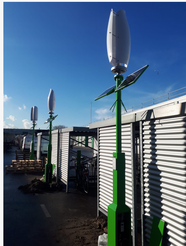
Wind and Solar E-bike Charging Poles