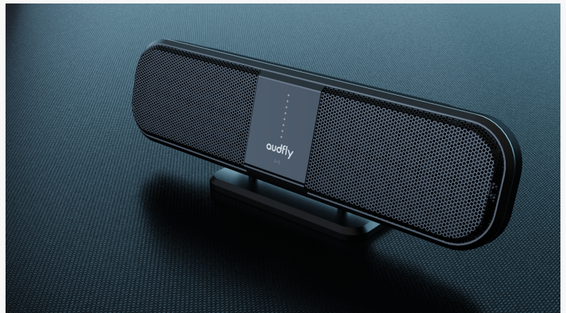
Model X2 Directional Speaker