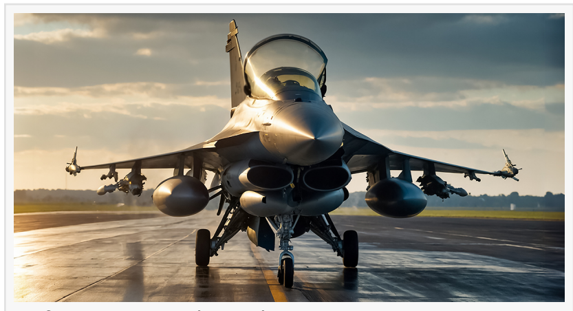
Defense Parts and Supplies USA

September 6, 2024 /EINPresswire.com/ -- Aerospace Unlimited, an online purchasing platform operated by ASAP Semiconductor, has moved to solidify its position as a leading resource for defense parts and supplies through a