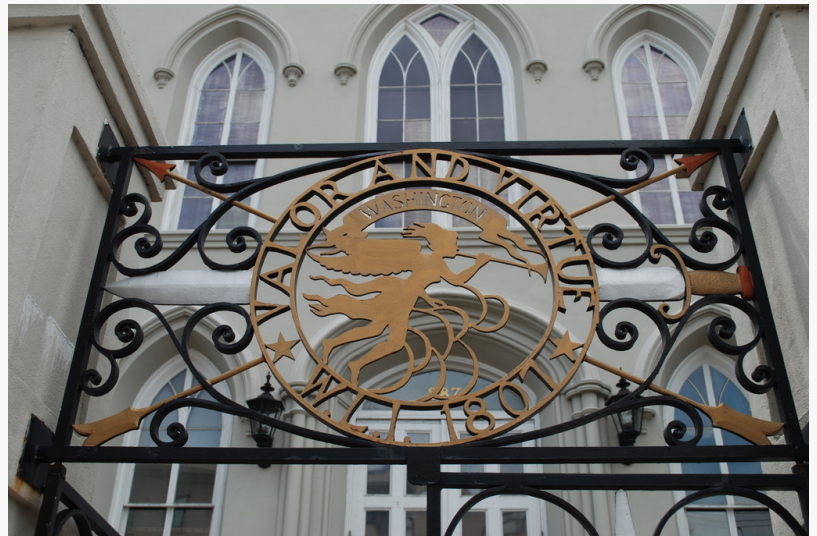
Entrance to Washington Light Infantry headquarters, Charleston, S.C.