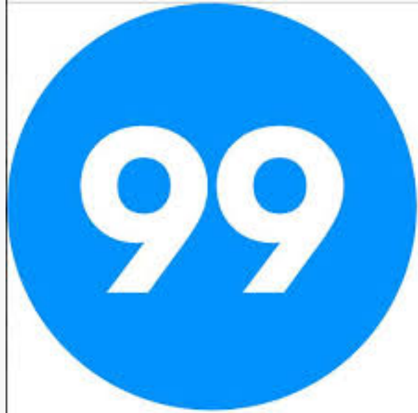
logo of 99offers.io

Homeowners using 99offers.io can submit their property details to receive competitive cash