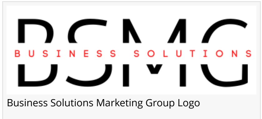
Business Solutions Marketing Group Logo

-- In an era where online reviews and digital footprints hold immense sway over consumer decisions, Business Solutions Marketing Group , a full-service marketing agency, emphasizes the critical role of reputation management for businesses in 2024.