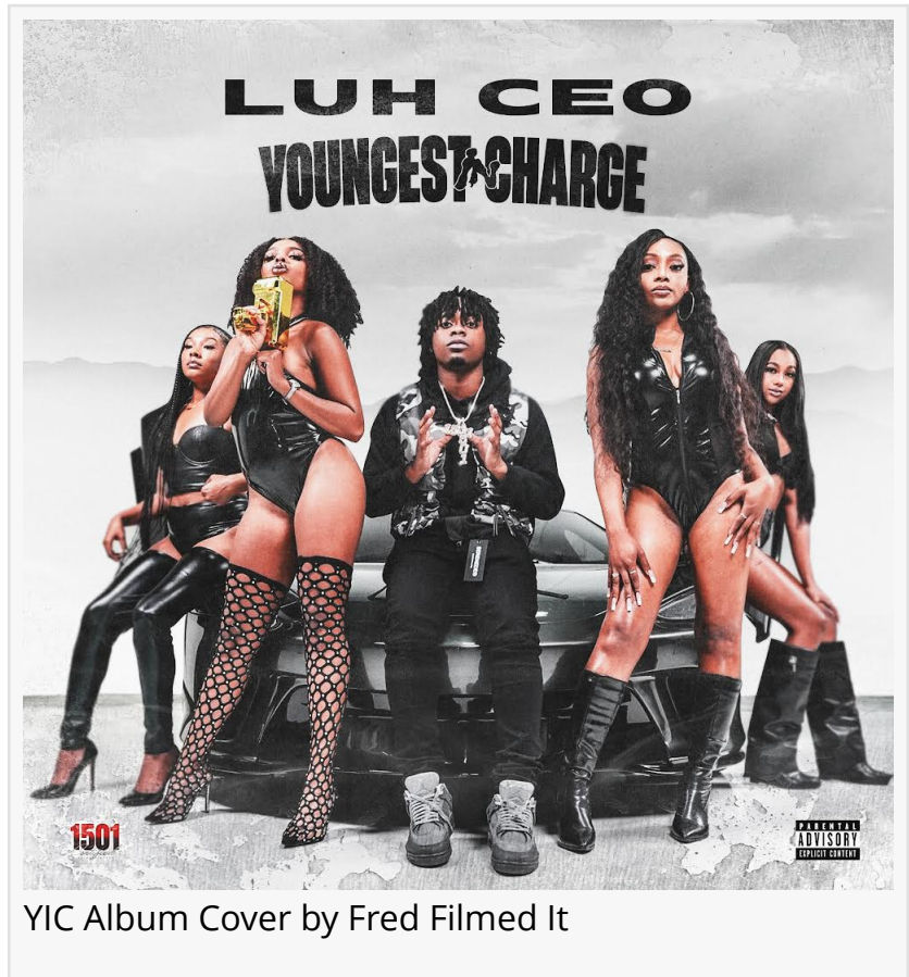
YIC Album Cover by Fred Filmed It

LUH CEO on the YIC mixtape "The name Youngest In Charge comes from me always being the