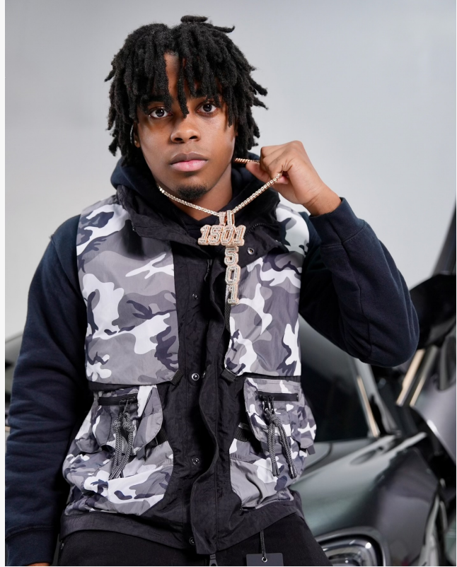
LUH CEO YIC

This press release can be viewed online at: https://www.einpresswire.com/article/741354561