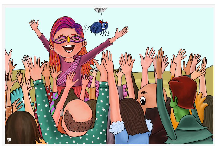
The crowd cheers Hallie O'Ween for defeating the goblins.

But what about the little ones? Our kiddos shouldn't be left out of the festive fun, and the new character,