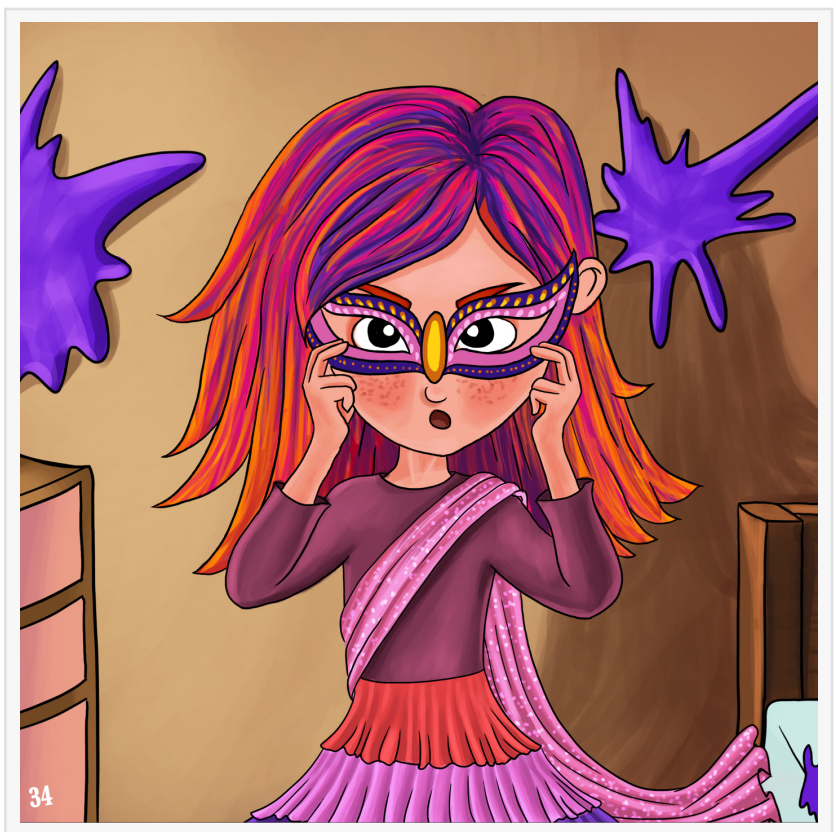
Hallie O'Ween puts on her mask.