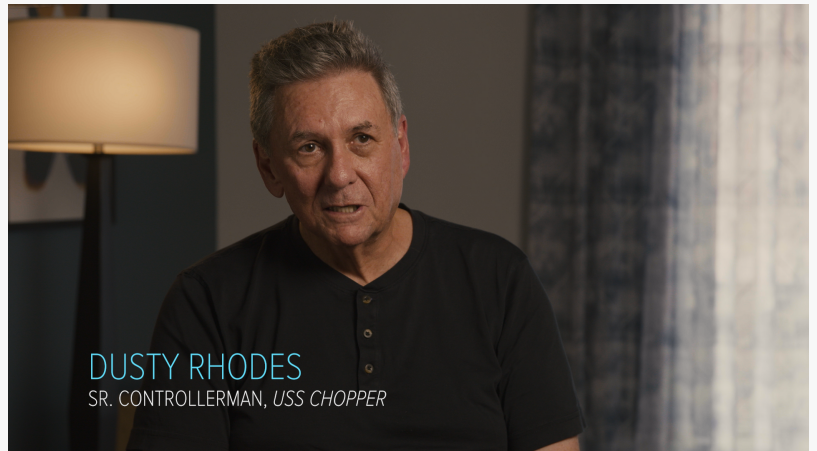
Interview with Survivor