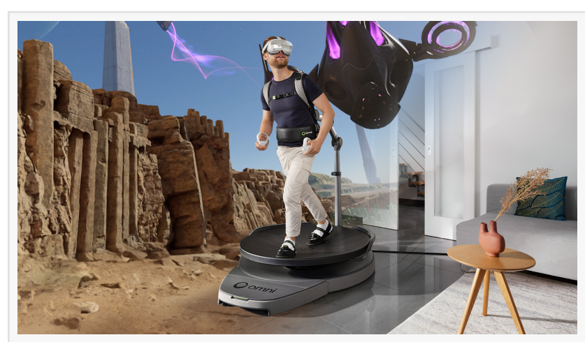
Explore with Omni One

Omni One comes with everything you need including a customized Pico 4 Enterprise headset along with the treadmill and overshoes with sensors for tracking movement. Assembly and