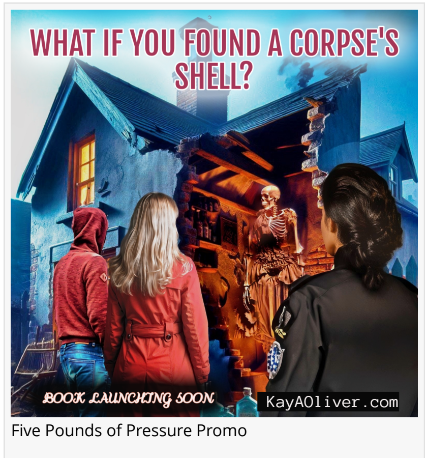
Five Pounds of Pressure Promo

"Five Pounds of Pressure" will be available in print and digital formats on September 23rd. Readers can pre-order their copies on major platforms like Amazon , Barnes & Noble, and local independent bookstores.