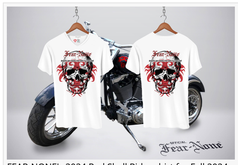
FEAR-NONE's 2024 Red Skull Rider shirt for Fall 2024

This press release can be viewed online at: https://www.einpresswire.com/article/741478265