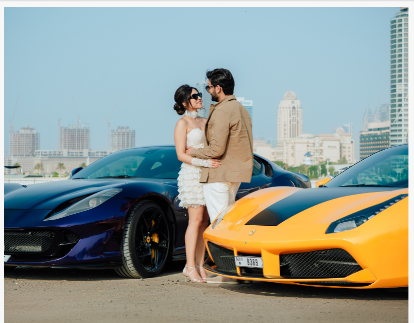
Supercar Adventure, Dubai

UNITED KINGDOM, September 9, 2024 /EINPresswire.com/ -- Qrated World, a leading luxury travel designer and experiential concierge service announces the expansion of its bespoke travel and event planning offerings. The company specializes in creating personalized journeys and unique events, with a particular focus on Dubai's most exclusive and authentic experiences.