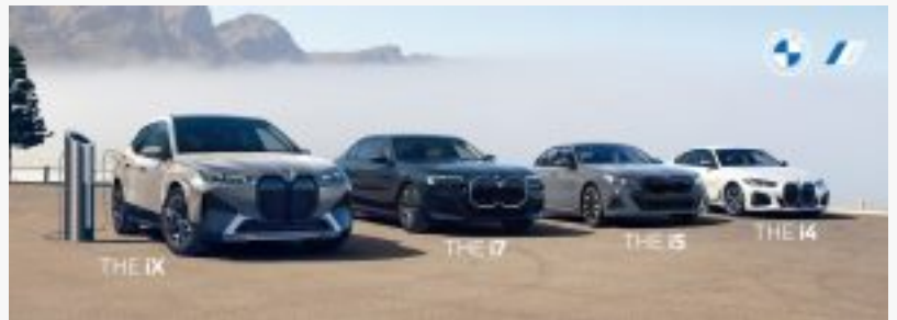
25+ EVs on display - some available for test drives!