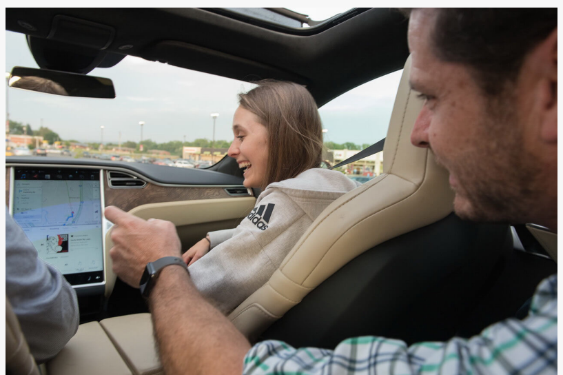
Get behind the wheel of an EV at NEEVS!