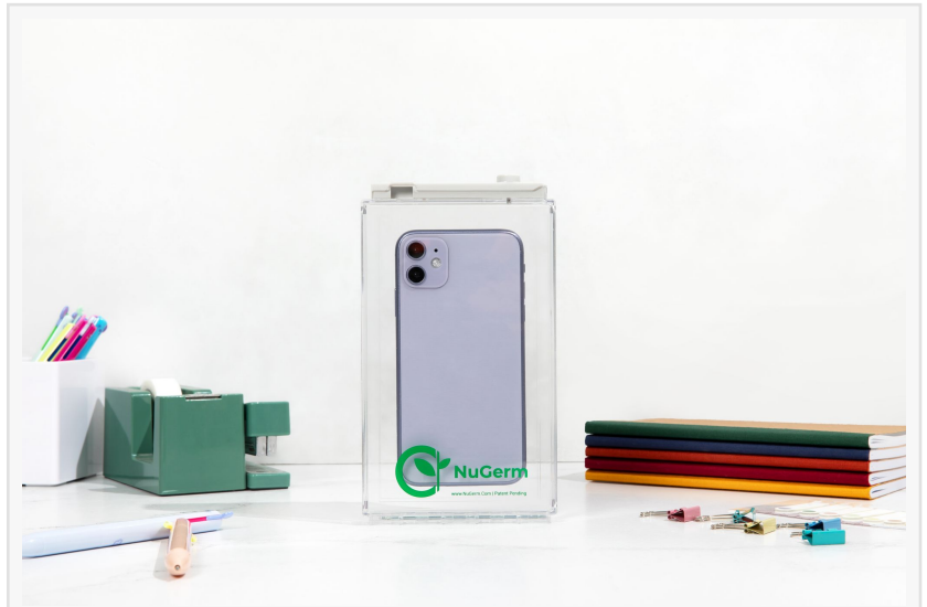
NuKase Student Phone Cases