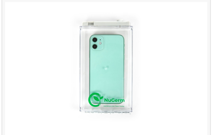
NuKase Student Phone Cases