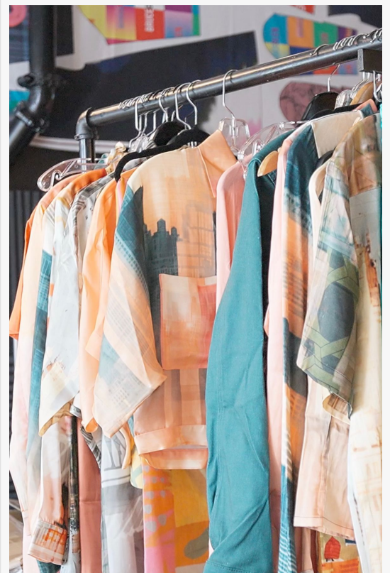
Tropical Metropolis 1613 by Albania Rosario & Angie Polanco

This collection is designed and produced utilizing the most advanced eco-friendly technology using natural resources such as organic cotton, vegan silk, and other materials by Resonance in Santiago, Dominican Republic. Its unique and avant-garde style reflects a perfect combination of artistic creativity and innovation exploring new fashion frontiers and breaking established limits, offering novel and original work focusing on generating jobs stimulating economies while protecting the environment.