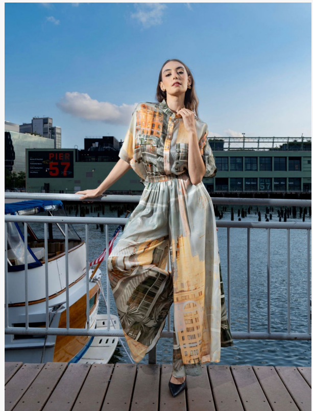
Tropical Metropolis Collection 1613