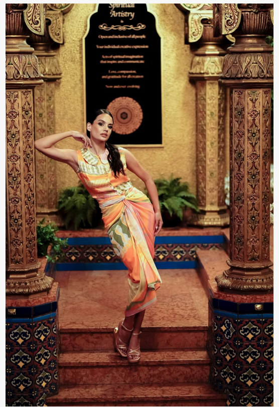
Tropical Metropolis 1613 at United Palace

This press release can be viewed online at: https://www.einpresswire.com/article/741814866