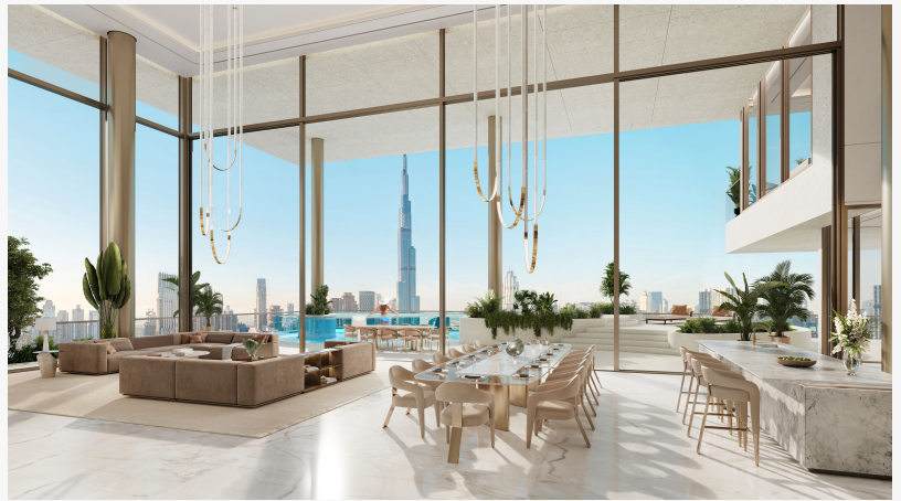
Fairmont Residences Solara Tower 1

Fairmont Residences Solara Tower in Downtown Dubai is a landmark skyscraper that redefines luxury living. The tower features a unique architectural design with a stepped top and a facade of glass and light-colored panels. It is surrounded by lush greenery and modern landscaping, including palm trees and manicured lawns. The tower is set in a prime location in Downtown Dubai, near the Burj Khalifa and other iconic landmarks. The project is a collaboration between Fairmont Hotels & Resorts and a local developer, offering a blend of international and local architectural influences. The tower is expected to be completed in 2025 and will offer a mix of residential and commercial spaces. The tower's design is a testament to the city's commitment to innovation and excellence in architecture. The tower's location is a key factor in its appeal, as it provides residents with easy access to the city's best amenities and services. The tower's design is a perfect example of how modern architecture can be both functional and beautiful. The tower's completion will add to the city's skyline and provide a new landmark for residents and visitors alike. The tower's design is a reflection of the city's vision for the future, and it is a source of pride for the city's residents and leaders. The tower's completion is a significant milestone for the city and a testament to the city's progress and growth.