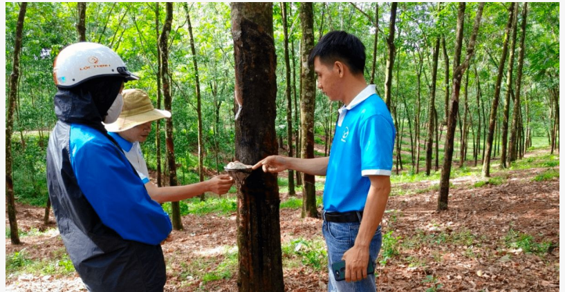
Huy Anh Rubber Co., Ltd. strengthens its position in the global rubber industry by complying to the EUDR

HO CHI MINH, VIETNAM, September 9, 2024 /EINPresswire.com/ -- Huy Anh Rubber Co., Ltd., a prominent player in Vietnam's rubber sector, has taken a significant step toward sustainability by partnering with KOLTIVA , a leading sustainable agriculture and supply chain traceability company. This