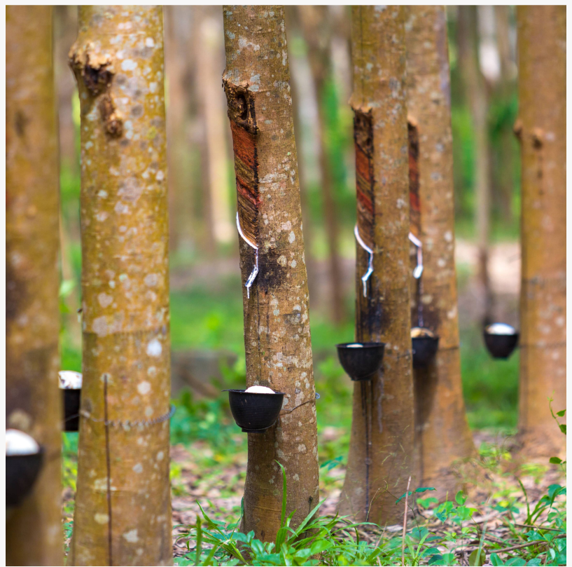
Rubber stands as one of a major driver of deforestation and is included as 7 commodities regulated by EUDR

quality natural rubber products such as SVR10/TSR10, TSR20, RSS3, SVR3L, SVRCV60, Masticated Rubber, and Compound Rubber. With the demand for sustainable rubber products grows, Huy Anh is significantly expanding its cultivation area, with projections to increase from 3,000 hectares in 2024 to 15,000 hectares by 2025. Given the vast yet fragmented nature of its small-scale cultivation areas, it is crucial for Huy Anh to develop a comprehensive traceable supply chain that links its factory, suppliers, and producers. In a significant move, Huy Anh has enlisted the expertise of KOLTIVA to achieve EUDR compliance. KOLTIVA's innovative supply chain traceability and EUDR solutions are designed to help companies navigate the complexities of the regulation. Through this collaboration, Huy Anh aims to enhance its supply chain transparency, ensuring that its products are not only sustainable but also free from deforestation—a key requirement of the EUDR.