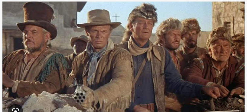
The 1960 John Wayne Alamo Movie