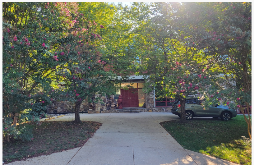
Upscale home for sale in Cabin John MD with cathedral ceilings, on a sloped lot

CABIN JOHN, MD, MD, UNITED STATES, September 9, 2024 /EINPresswire.com/ -- Are you tired of the usual stick homes? There are special homes in the Bethesda , Potomac , or Cabin John area of Maryland. A custom Deckhouse with cathedral ceilings throughout, on a sloped lot, surrounded by green, and only a short commute from downtown Washington, DC, Dulles International Airport, and Reagan National Airport.