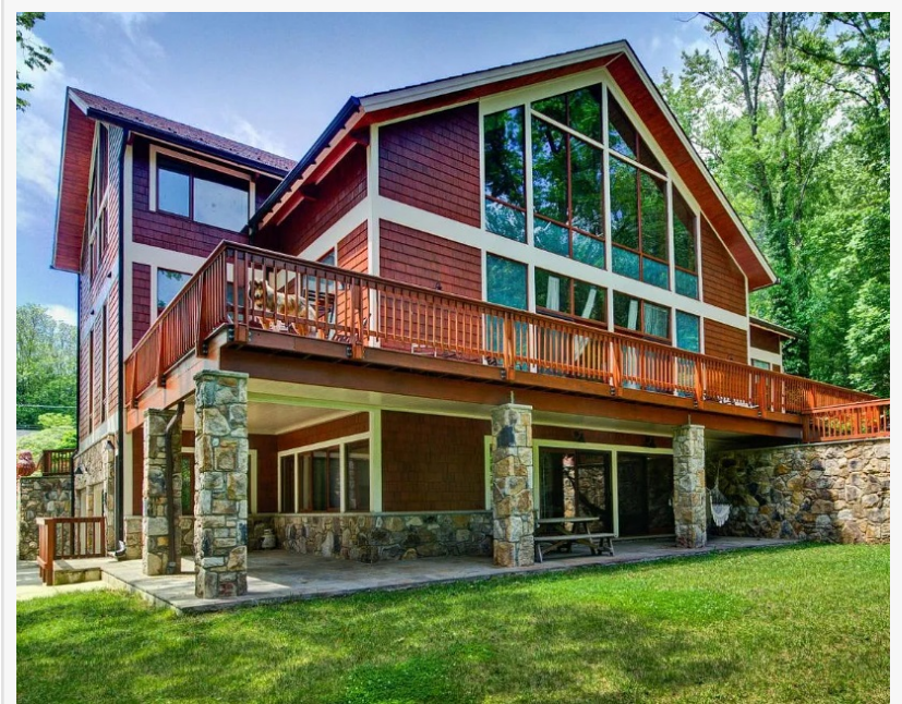
Upscale home for sale in Cabin John MD with cathedral ceilings, on a sloped lot