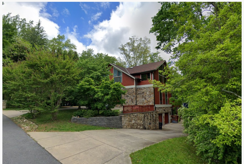
Upscale home for sale in Cabin John MD with cathedral ceilings, on a sloped lot