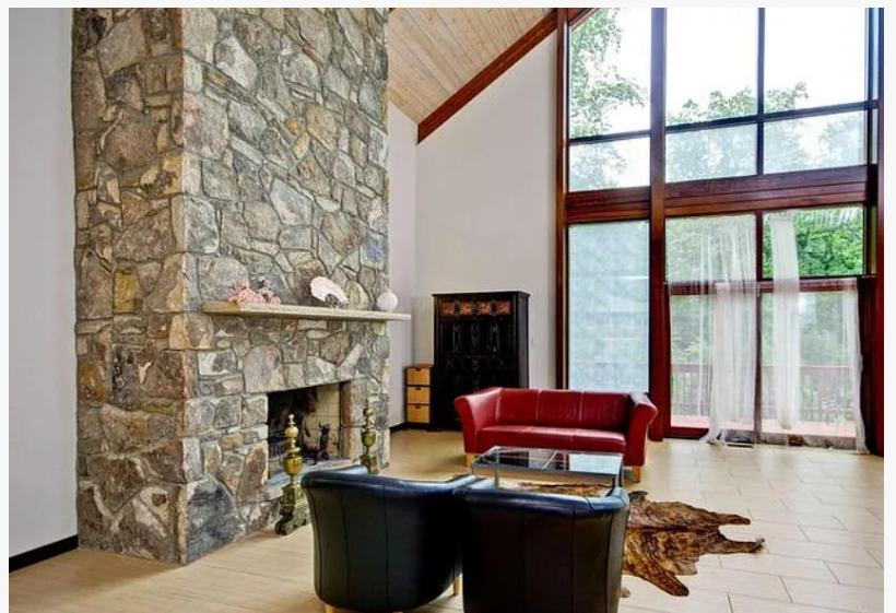
Upscale home for sale in Cabin John MD with cathedral ceilings, on a sloped lot